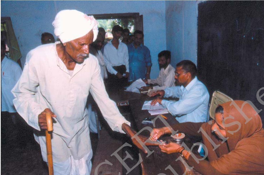
Voting in a rural area: A mark is put on the finger to make sure that a person casts only one vote.

decisions for the entire population. These days a government cannot call itself democratic unless it allows what is known as universal adult franchise. This means that all adults in the country are allowed to vote.